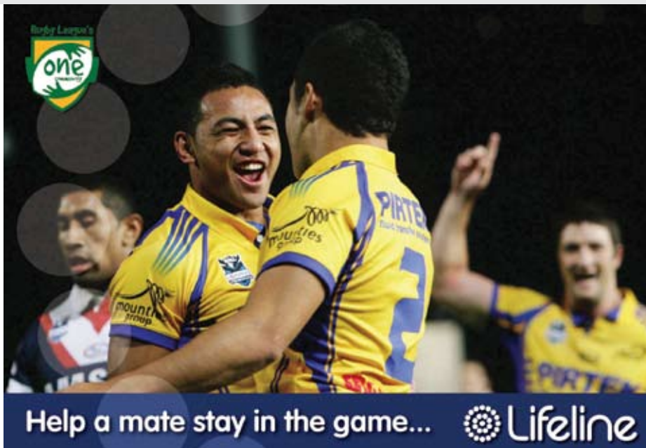
Lifeline Aus - NRL Campaign

responds to all donations within 24 hours.